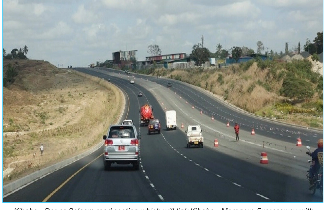
Kibaha - Dar es Salaam road section which will link Kibaha - Morogoro Expressway with Dar es Salaam Port

Residents in communities around projects may be engaged to supply goods, or provide services on minor works.